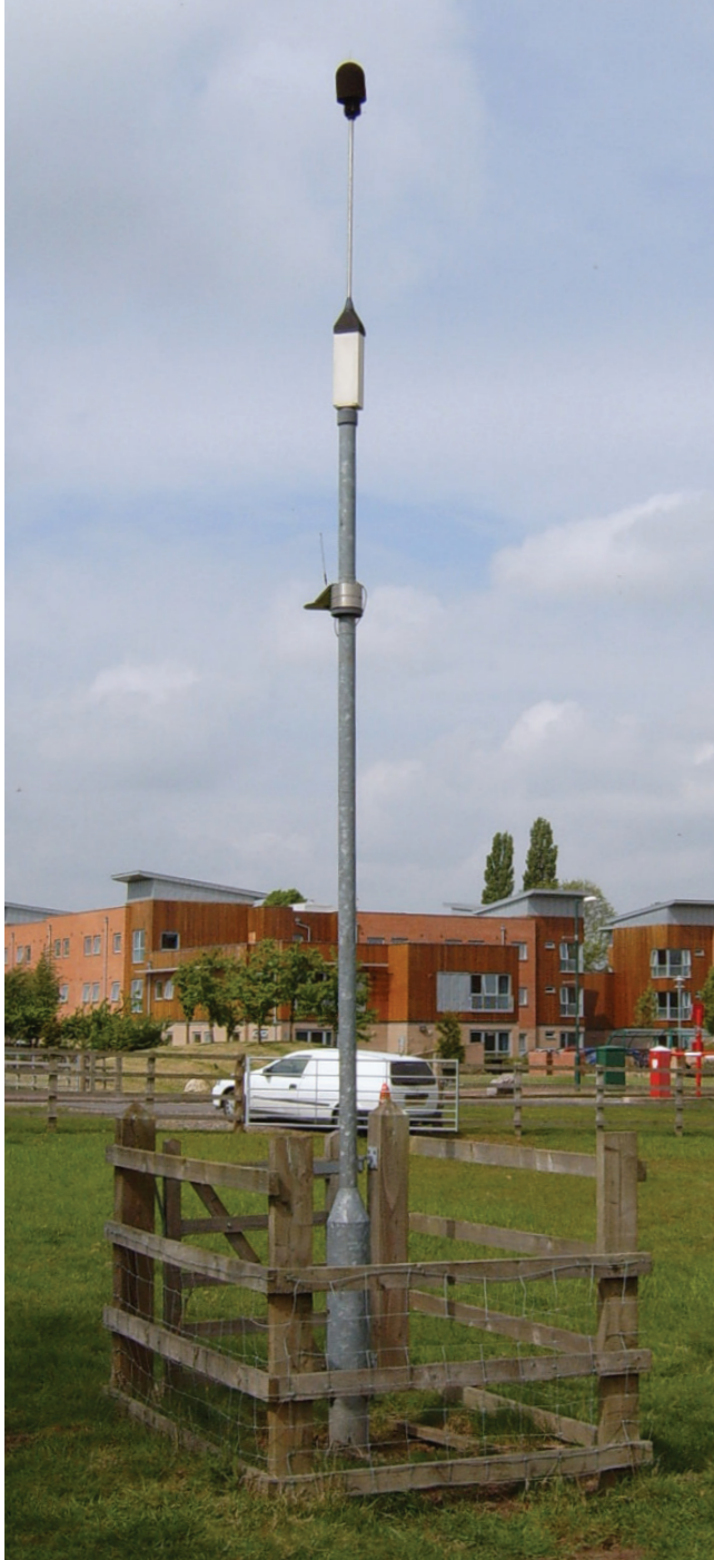
CR:243/4 "Noise Pole" installed as 1 of 7 monitors in an airport noise monitoring system