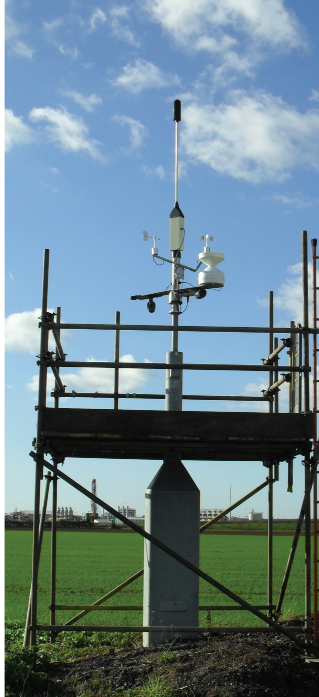
CR:243/1 Noise Monitor during installation as part of an environmental noise monitoring system